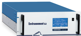
MIR 9000 19" rack version

Designed to measure dry and corrosive sample, the MIR 9000 measures up to 10 gases simultaneously: HCl, HF, NO, NO 2 (NOx), SO 2 , CO, CO 2 , N 2 O, CH 4 , TOC and O 2