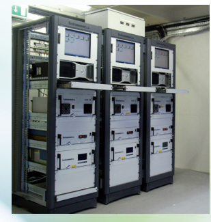
MIR FT rack cabinet