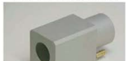
Sirius Cooling Housing KG60

Scope of supply: Sensor with lens, 2 mounting nuts M40 x 1.5 and Manual. Connecting cable with Software has to be ordered separately