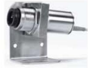
Sirius Mounting Bracket HA11

Scope of supply: Sensor with lens, 2 mounting nuts M40 x 1.5 and Manual. Connecting cable with Software has to be ordered separately